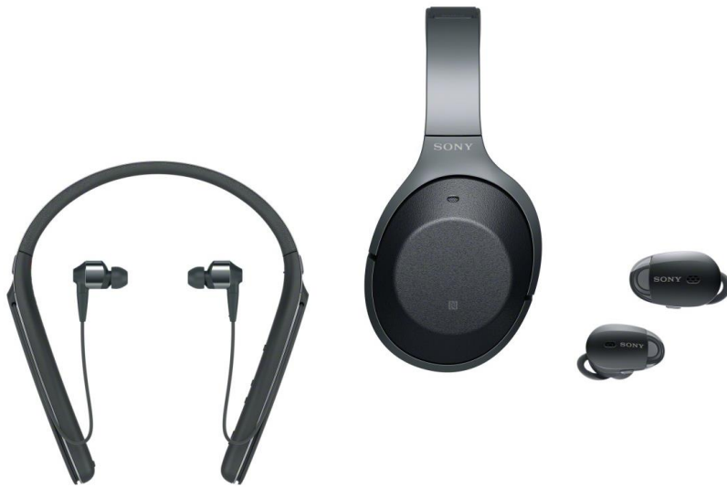
WI-1000X, WH-1000XM2 and WF-1000X

'Sony | Headphones Connect' app updated with the world's first 1 activity-recognising 'Adaptive Sound Control' and 'Atmospheric Pressure Optimising' features